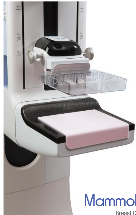
MammoPad ® Breast Cushion

The most frequently reported source of pain in mammography is compression, followed by discomfort caused by the edges of the image receptor. MammoPad cushions reduce this discomfort and take the chill off the receptor surface, helping reduce patient anxiety. Studies have shown that the softer mammogram provided by the MammoPad cushion reduces discomfort by 50% for three out of four women. 1,2