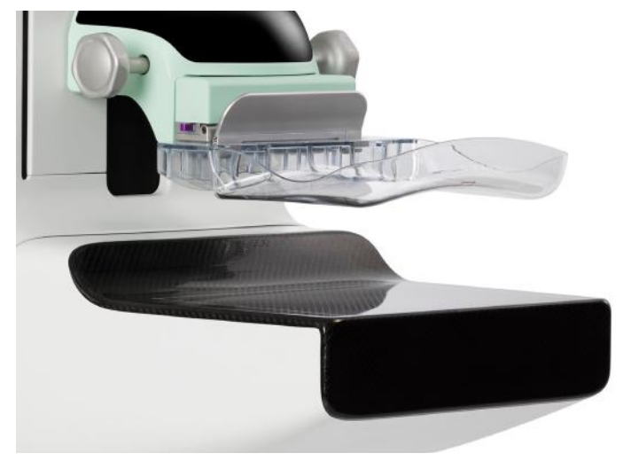
The SmartCurve breast stabilization system conforms to the shape of the breast with additional curvature at the chest wall to reduce pinching.